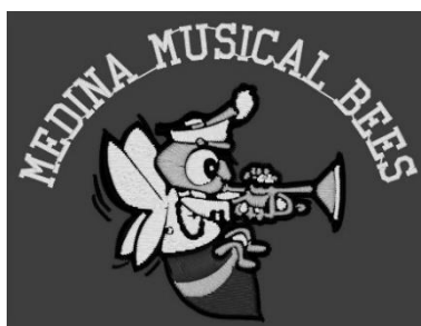
Design #5 for Embroidery