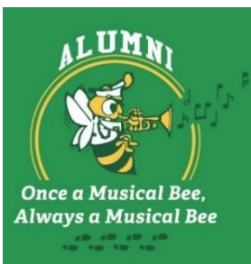
Design #4 Alumni Shirt