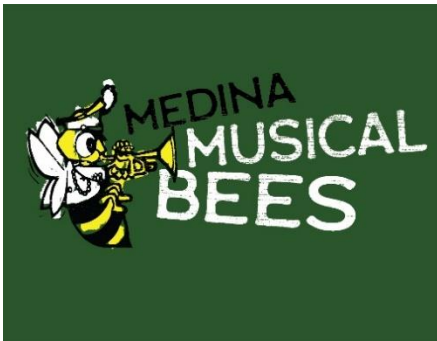
Design #1 Medina Musical Bees