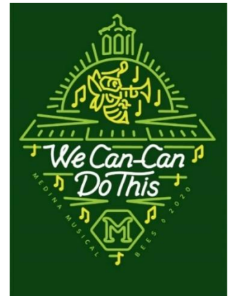
Design #3 Show Shirt